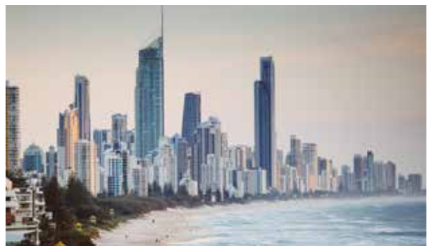
Connecting north and south, the view north from North Burleigh