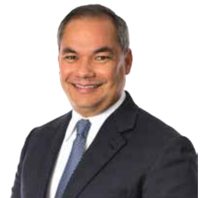
TOM TATE MAYOR