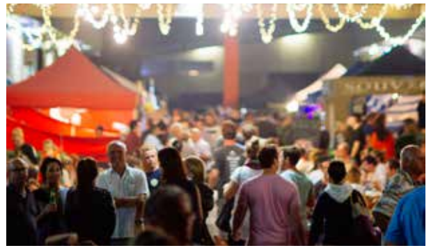
The sights and sounds of Miami Marketta