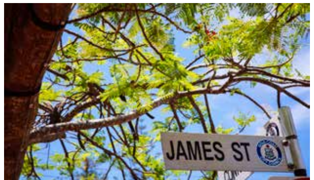
Improved access to popular shopping areas

The route passes through light industrial areas providing a better way of commuting to work for many workers.