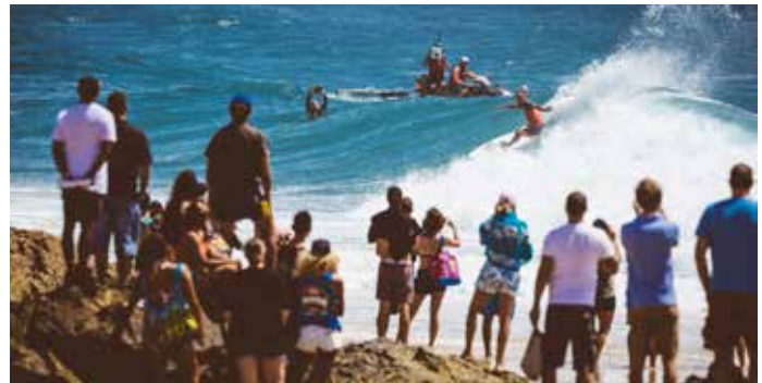
Iconic locations and iconic events opened up to a wider audience. Quicksilver Pro, Snapper Rocks

City's role as Australia's premier tourist destination and encourage our export sector to further domestic and international destinations while creating a seamless link from the south to north of the city.