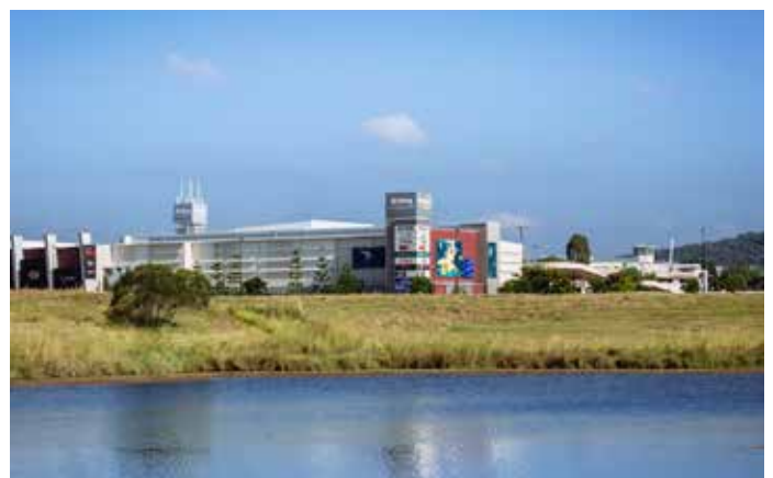
Connections to major shopping and business centres, Robina Town Centre

This extension would improve access to the business precincts in and around Robina and provide a link between residential areas, the coastal strip and Southport CBD. It would also provide easy access for inbound tourists from the north who choose to travel down to the coast by train.