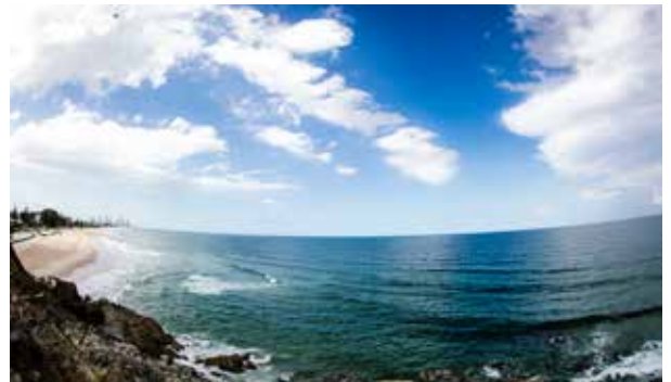
Nobby Beach and Miami, just a short stop away