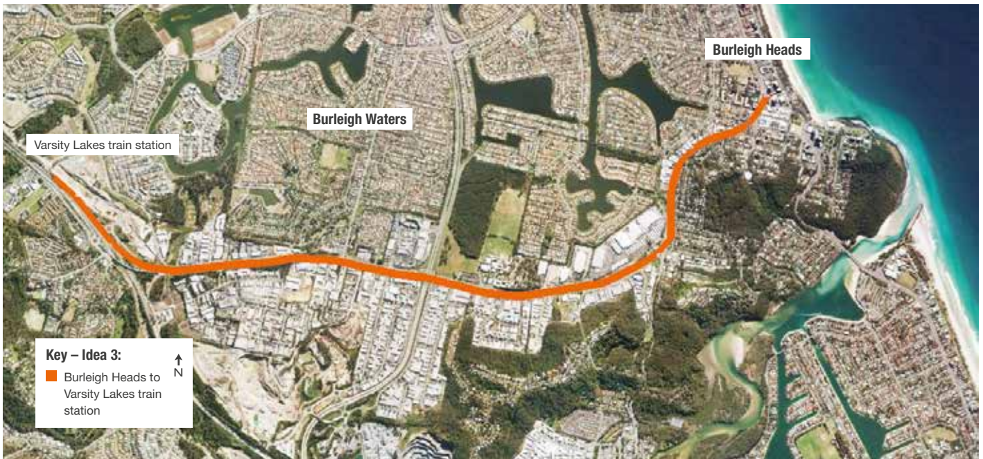
Proposed options are indicative only and do not represent any established plans.