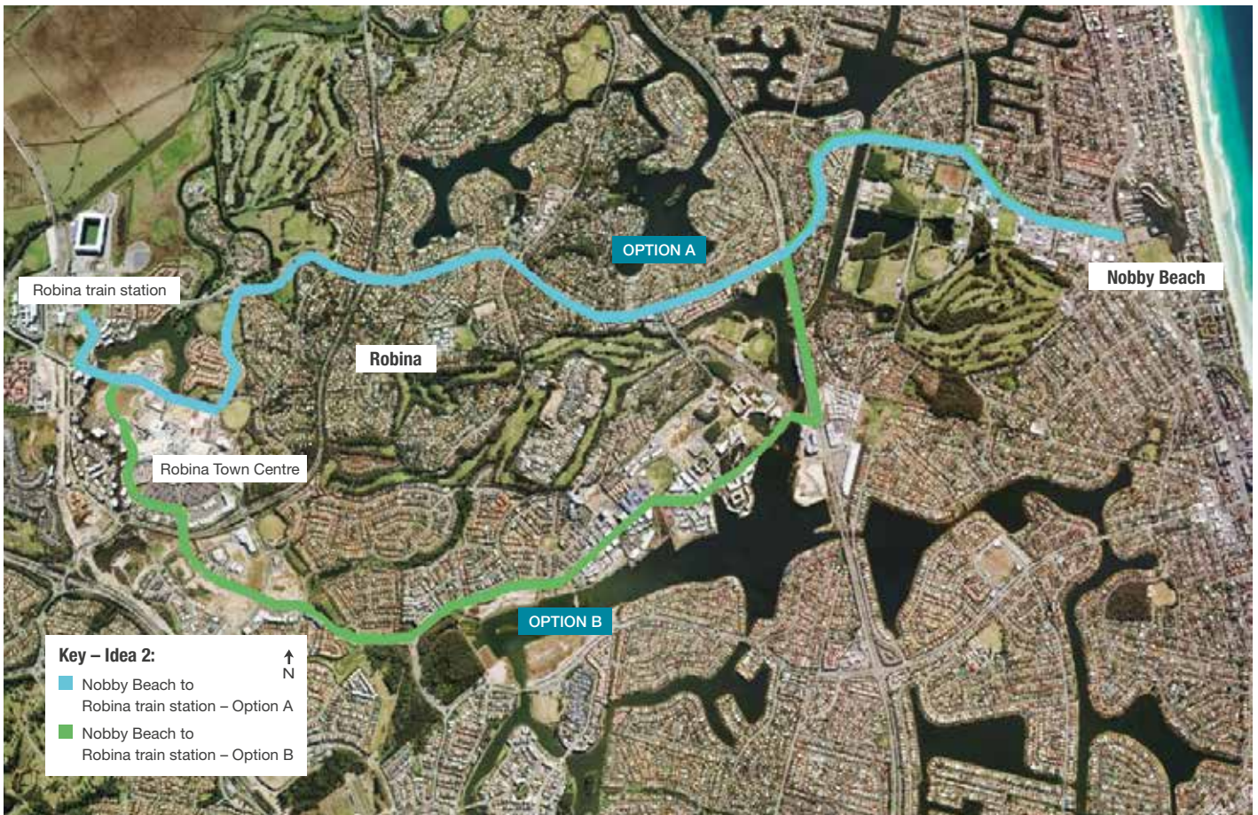
Proposed options are indicative only and do not represent any established plans.