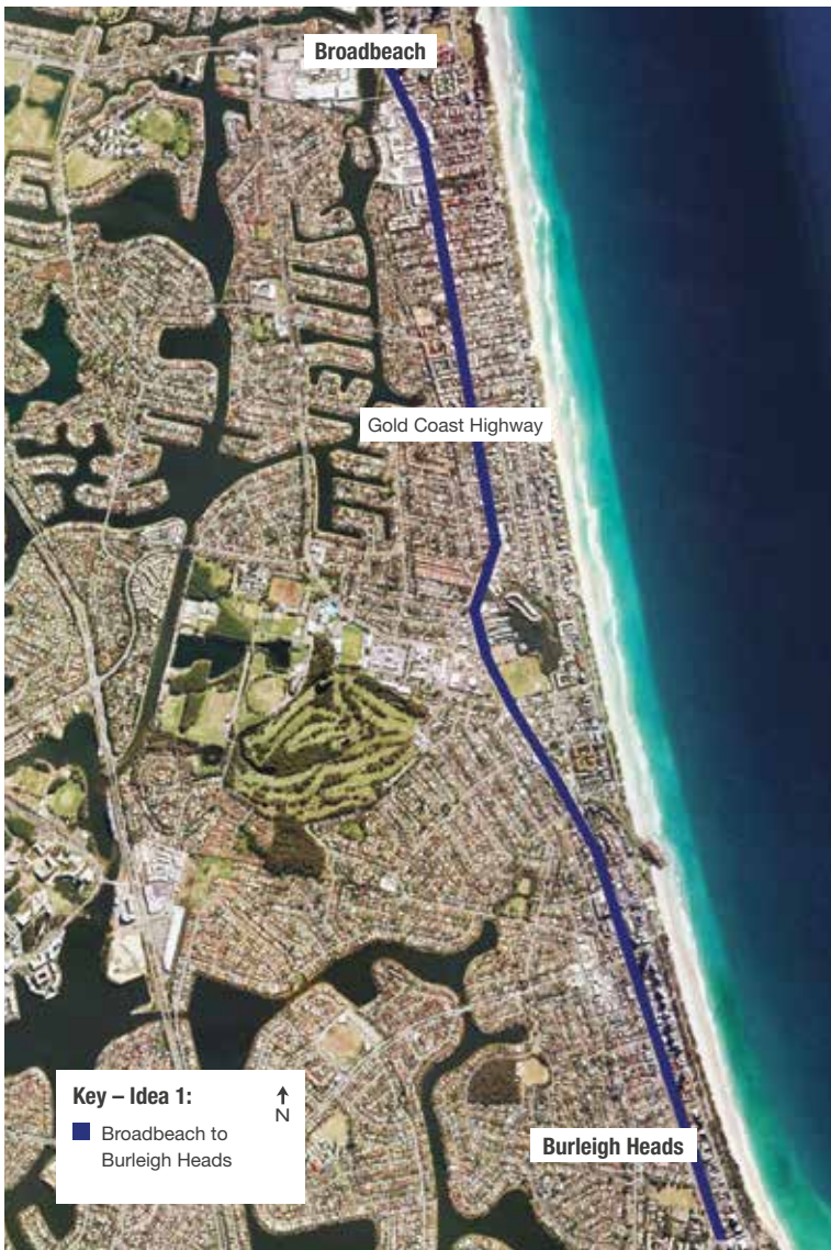
Proposed options are indicative only and do not represent any established plans.