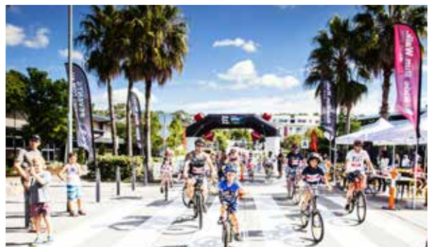
Joining in at community events, Varsity Lakes